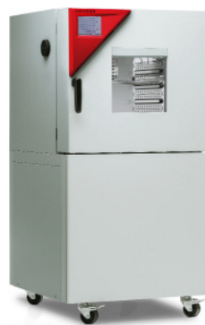
› MKF 56 dynamic climate chamber