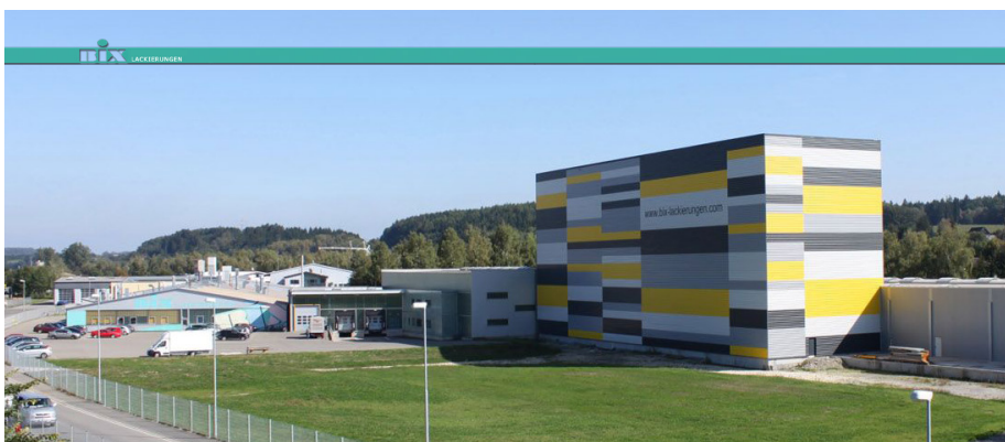
› Bix Lackierungen in Meßkirch