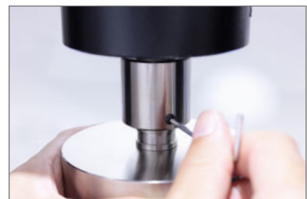
Connect the joint and plate, and fix by screw

Obtaining good quality compression test results requires a load evenly distributed over the specimen. In order to achieve this load distribution, the specimen should be aligned with the loading axis of the tester and the upper compression plate should be mounted parallel with the lower compression plate.