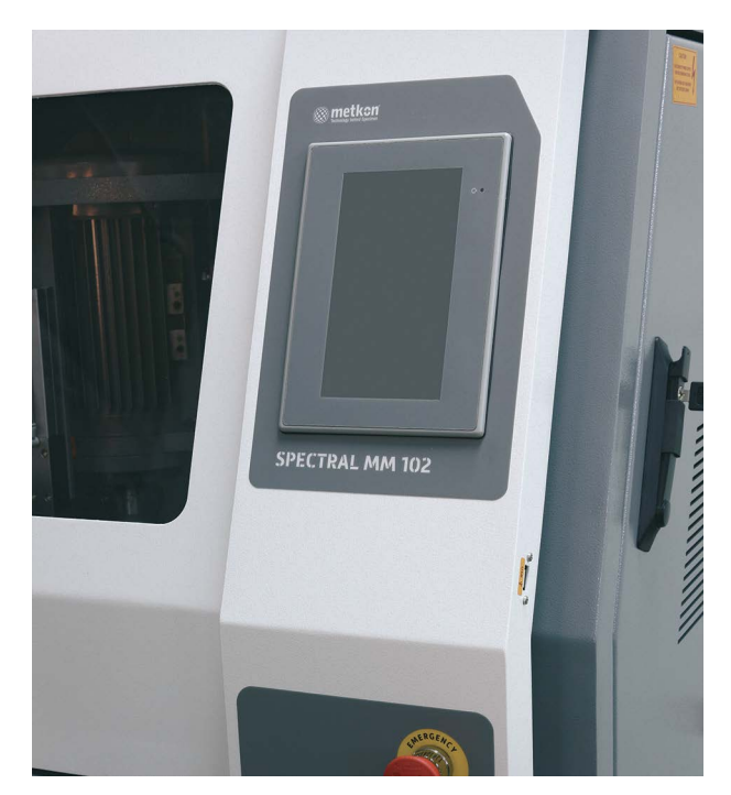
HMI touch screen controls with various milling methods and database with milling programs and maintenance monitoring