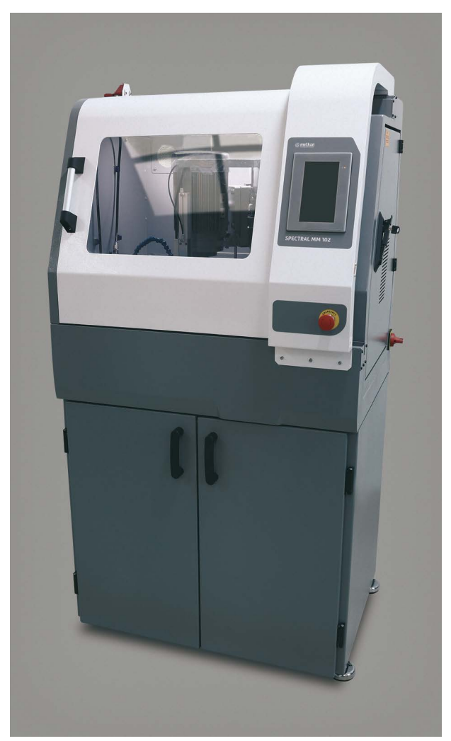
Spectral MM 102 with Floor Cabinet

The preselection of the milling feed rate (0,5-30 mm/sec) is possible from the touch screen LCD. The feed rate is automatically adjusted, if needed reduced, resulting in perfect surfaces and eliminating sample and machine damage.