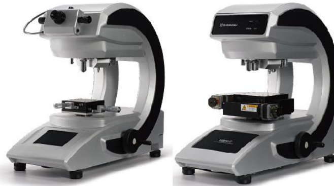
HMV-G30 (manual, without PC)